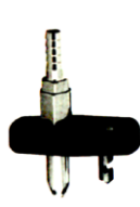
Ohmeda style female quick connect